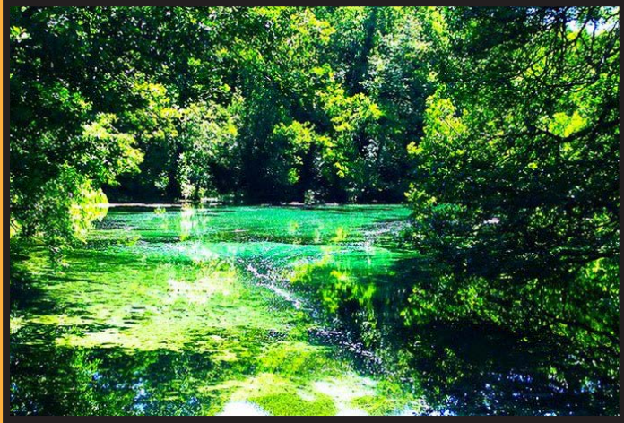
St. Naum springs