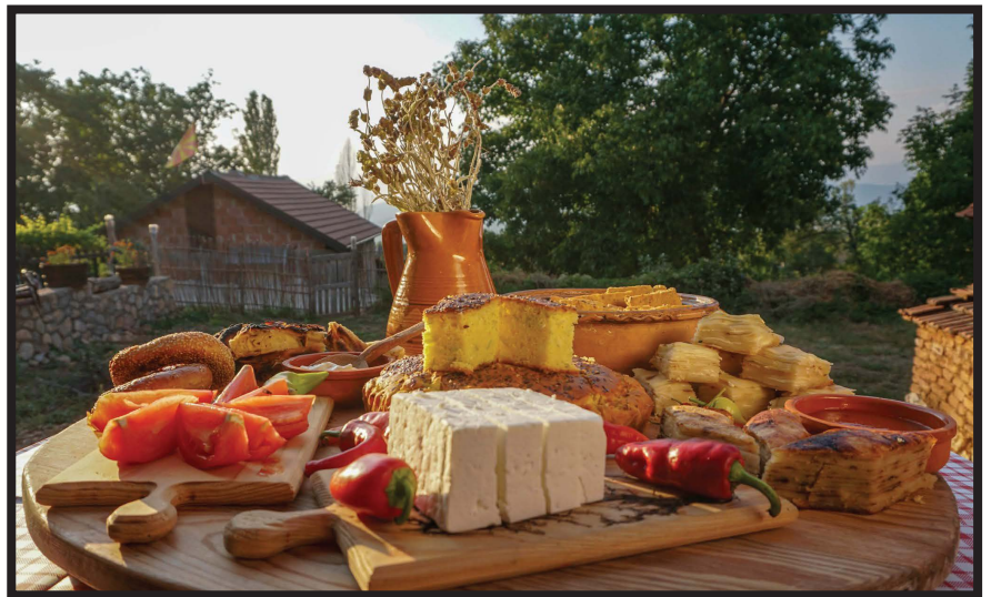
“Pirustija Nedanovski”, Ramne village