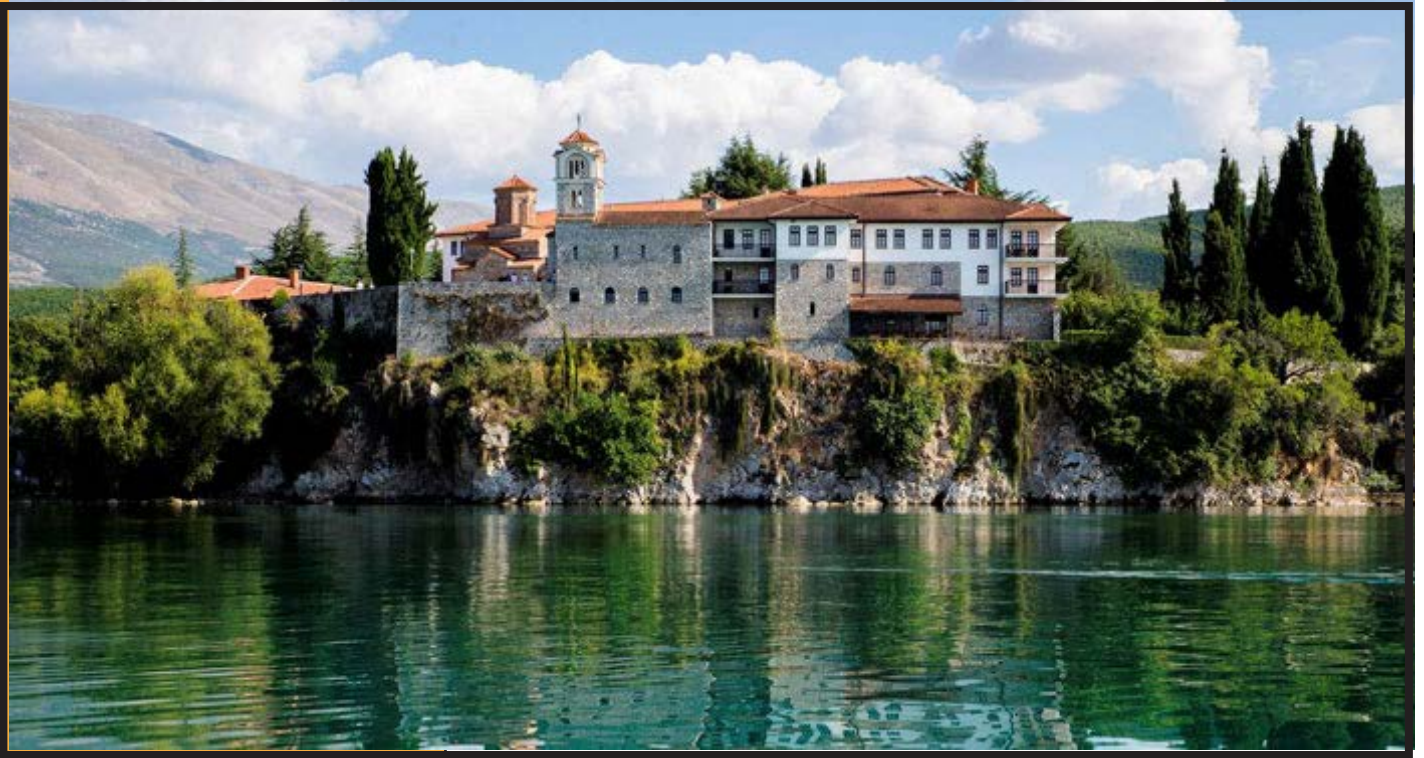
St. Naum monastery