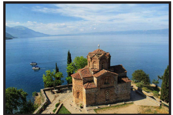
St. John Kaneo monastery