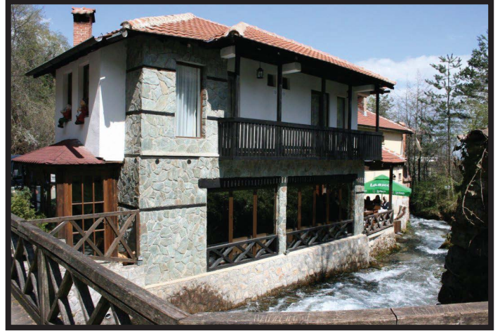
Restaurant “Izvor”, Vevchani