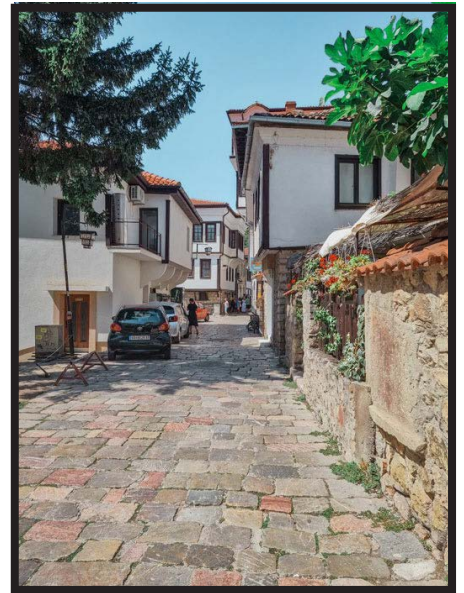
Old town Ohrid