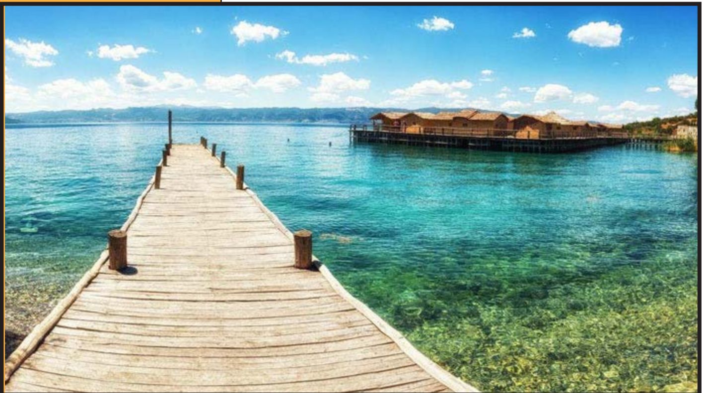
The Bay of the bones museum